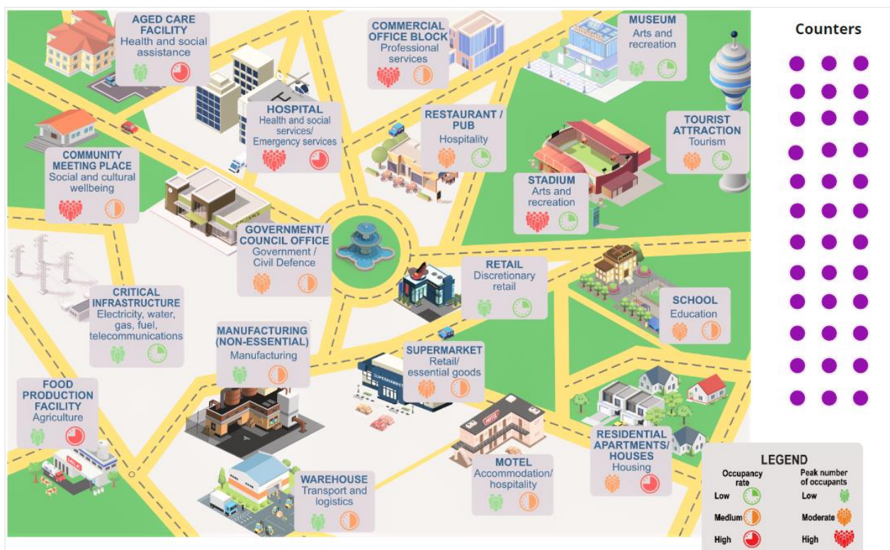
Figure 1 Town map used for exercises in Activity 1.

Details of the buildings included in the map, the services they provide, and the occupancies are included in Table 2.